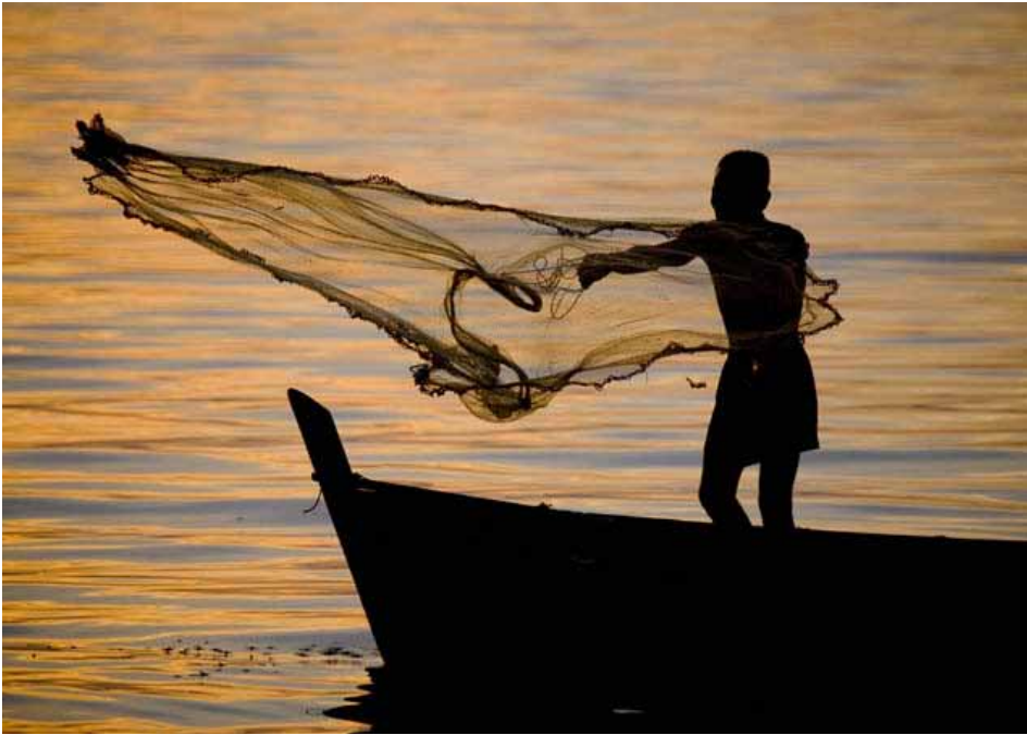
A fisherman in Malaysia. Tropical nations like Malaysia could experience a large reduction in fisheries catch as a result of ocean warming and fisheries shifting.

ecosystems that account for most of the world's fisheries. Then, for each ecosystem and each year from 1970 to 2006, they calculated the average temperature preference of the species, weighted by the amount caught. Finally, the researchers determined the connection between ocean warming and changes in fisheries catch by using a statistical model that separates out other factors, such as fishing effort and oceanographic variability.