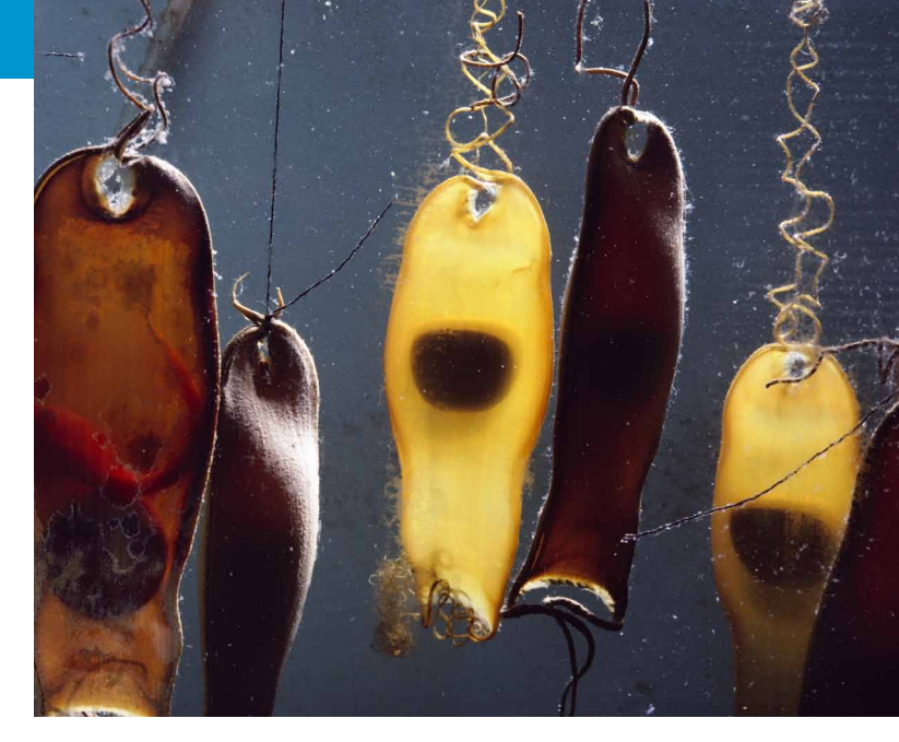
Swell Shark (Cephaloscyllium ventriosum) egg cases with embryos.

The population growth of any species depends on such lifehistory characteristics as the age at which the species can begin reproducing, how long it will live, and how many offspring it will have. These factors are also useful in predicting how quickly a population can recover from human activities such as fishing. With many of the world's shark populations declining, it is important to examine shark life-history characteristics and their management implications.