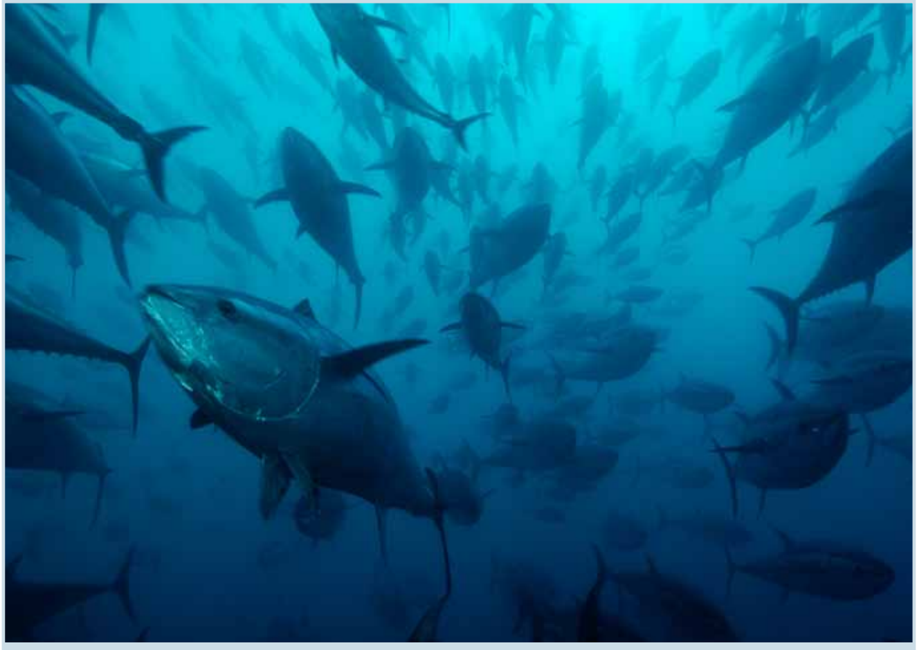
Caged bluefin tuna are being fattened for the sushi market.

The good news is that there is a growing body of science that is improving the understanding of bluefin biology and behaviour and offering hope for a new and better stock assessment model. ICCAT has recognised the need to incorporate this new science into its stock assessment. However, it is critical that, in line with scientific advice, Atlantic bluefin quotas do not increase until these assessments have been updated to reflect the best available science.