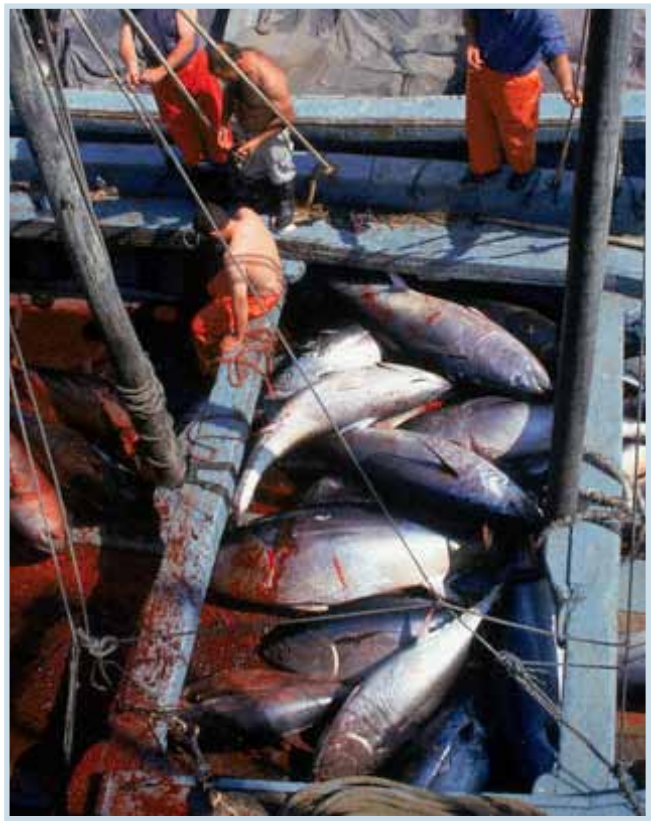
Atlantic bluefin tuna being removed from pens that are set annually off the southern coast of Spain.

The western population assessment currently uses two vastly different scenarios to model the adult-to-young ratio, or what fishery scientists refer to as the 'stockrecruit relationship' (SRR). Under the 'high recruitment' scenario, it is assumed that the number of young will increase as the number of adults increases, and therefore a much higher catch level is possible in the future if the population is allowed to rebuild. Under the 'low recruitment' scenario, it is assumed that