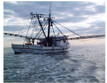
S. 2184/H.R. 4208 would more than double federal funding for regional fisheries management.

The FIRRA is new legislation that would provide dedicated funding to support the research, monitoring and management programs critical to sustaining ocean fish resources and fishing communities. The bill would restore the original uses of an existing revenue stream derived from duties on imported fish products – valued at an estimated $124 million for FY 2013 - to invest directly in the management of our nation's ocean fisheries.