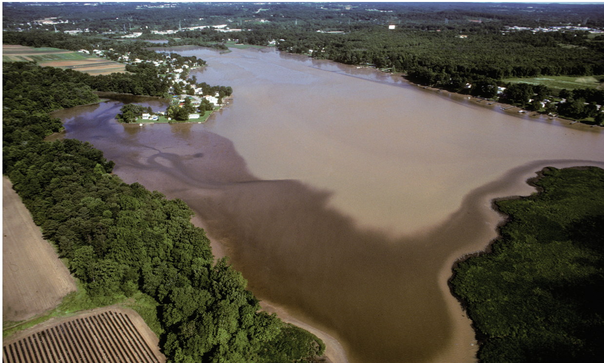
Runoff from city streets and farm fields causes pollution in the Chesapeake Bay.

But there is hope: After decades of pollution, a plan to save the bay is taking shape.