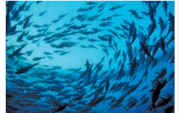
Tuna ranching off the coast of Italy, from inside the cage.

The Atlantic bluefin tuna supply chain is long and complicated, and the many steps along the way provide the opportunity for fraud and misreporting (see diagram, next page). In the Mediterranean Sea, the majority of bluefin tuna are caught by purse-seiners that target large aggregations of adult fish. The catch is then towed to floating ranching pens, where the fish are kept for up to two years while they are fattened to increase their market value. Using the technology in place today, it is