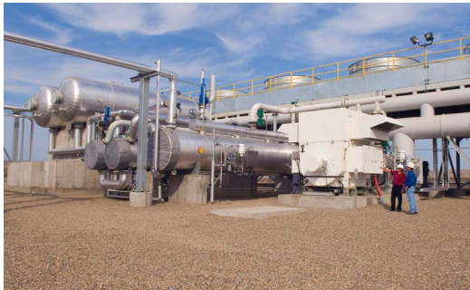
Pipeline CHP facility in St. Anthony, North Dakota.

In 2007, North Dakota established a voluntary renewable portfolio standard, an objective that includes CHP and WHP as eligible resources. Under the objective, 10 percent of all retail electricity sold in the state would be obtained from renewable and recycled energy sources by 2015. The target applies to all types of utilities. Municipal and electric cooperatives that receive wholesale electricity through a municipal power agency or generation and transmission cooperative can aggregate their renewable and recycled energy to meet the objective. This goal was surpassed in 2010 and at the end of 2013 the state surpassed 15 percent.